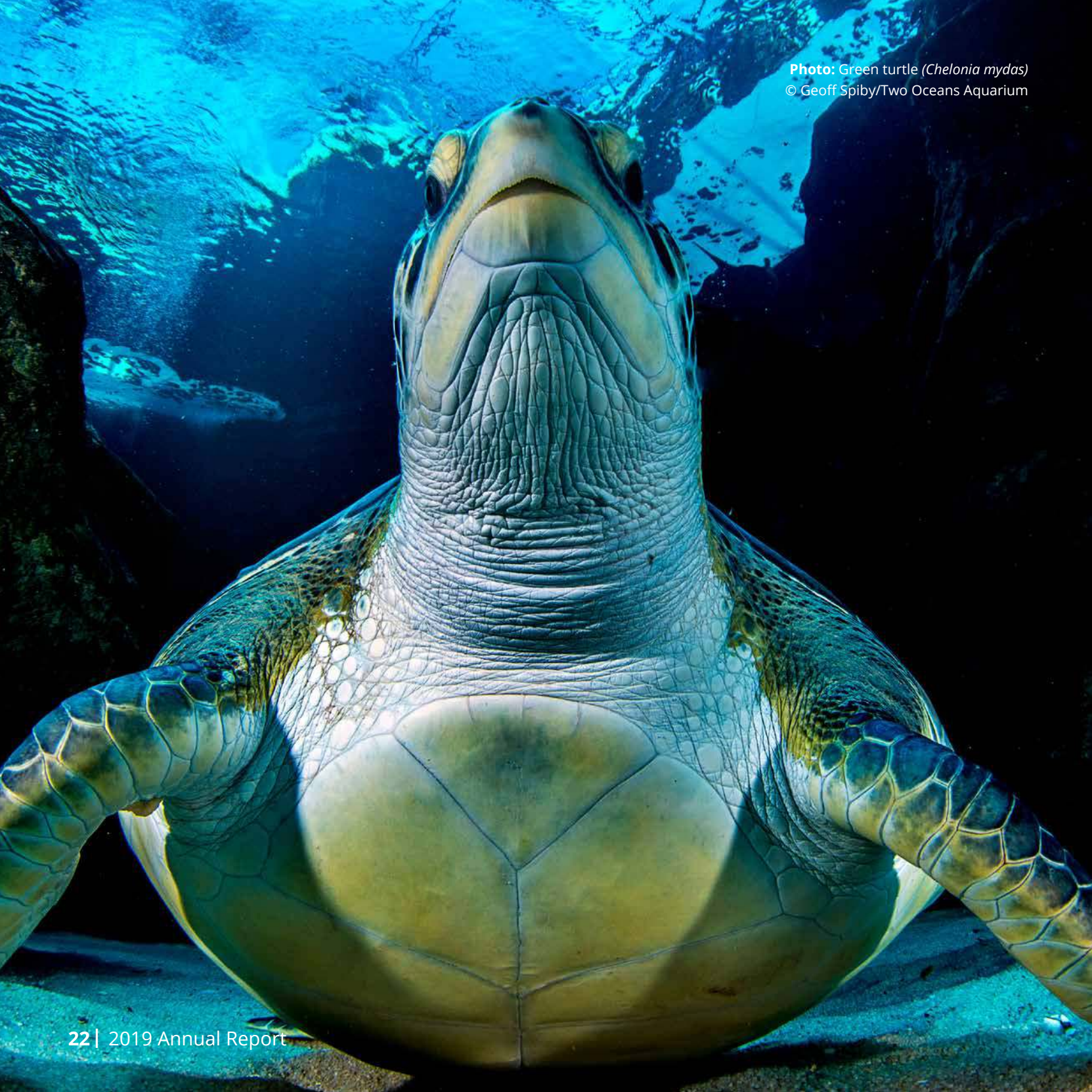
Photo: Green turtle ( Chelonia mydas ) © Geoff Spiby/Two Oceans Aquarium