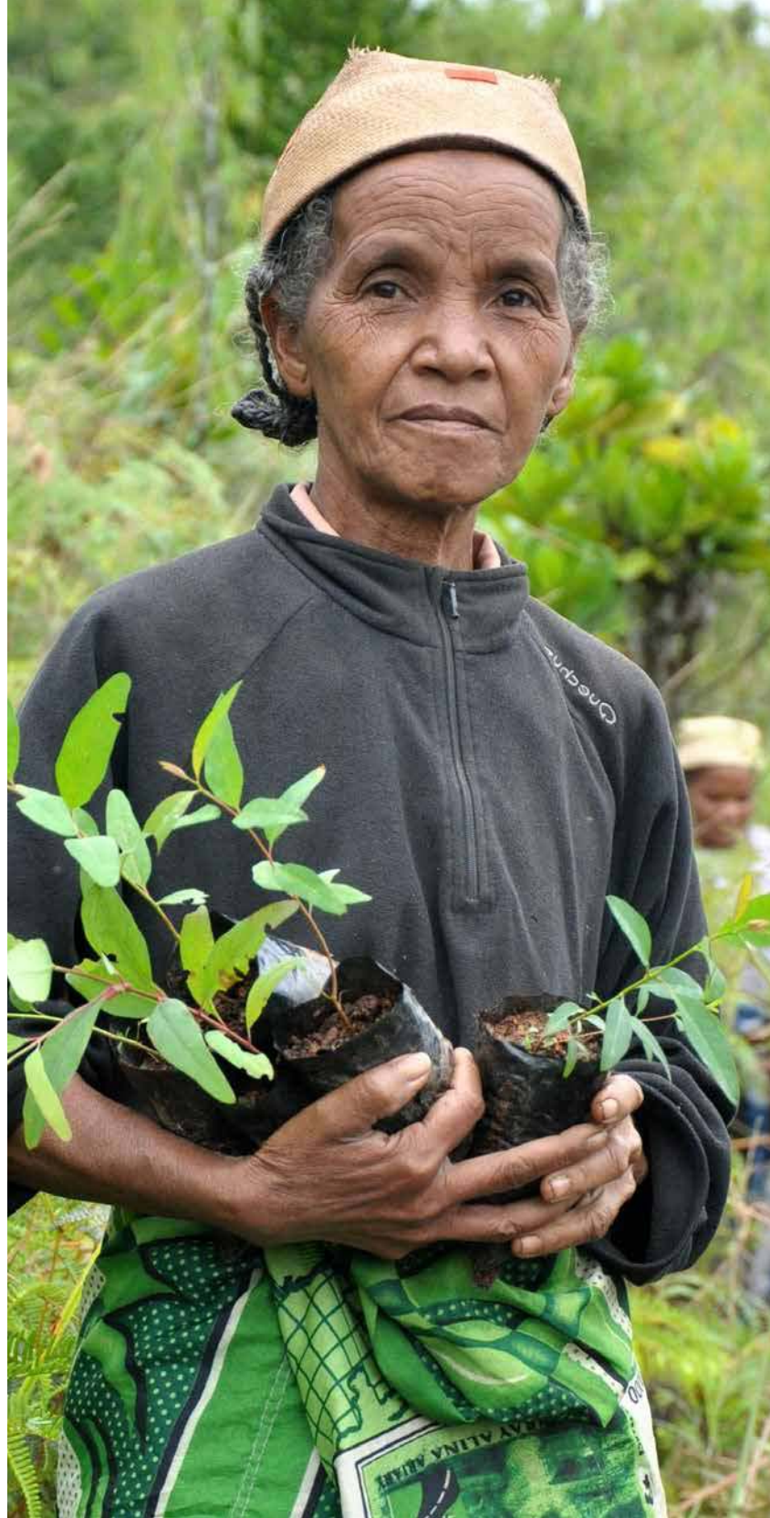
A woman holds tree saplings for reforestation as part of La Palmyre Zoo's Nature Connect Grant project.

- family participating in Dublin Zoo's Nature Connect project.