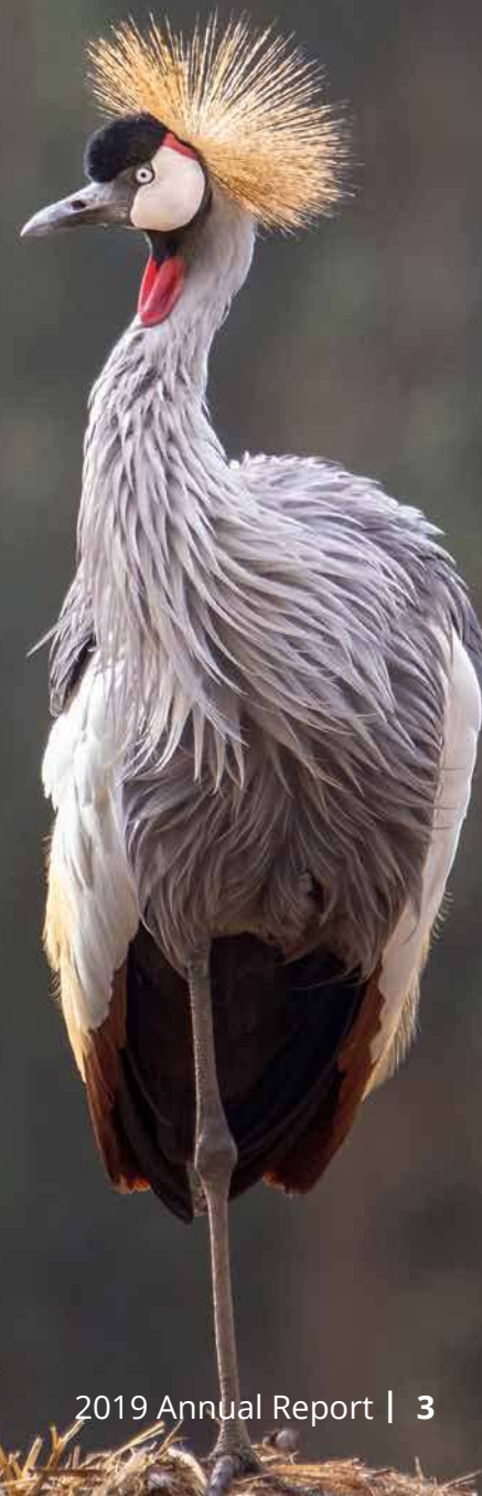
Photo: Grey crowned crane ( Balearica regulorum ) © Assaf Cohen/Zoological Center Ramat Gan

WAZA is the voice of a global community of high standard, conservation-based zoos and aquariums and a catalyst for their joint conservation action.